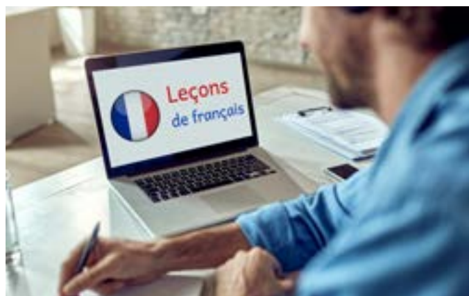
French lessons with an online teacher

SVI offers you the chance to master your English or French via online private lessons. All the teachers who work with SVI are competent and qualified. Whether you're learning the language for study, career, travel, volunteering or personal development, one-to-one online tuition is a fun and interactive way to develop the skills you need.