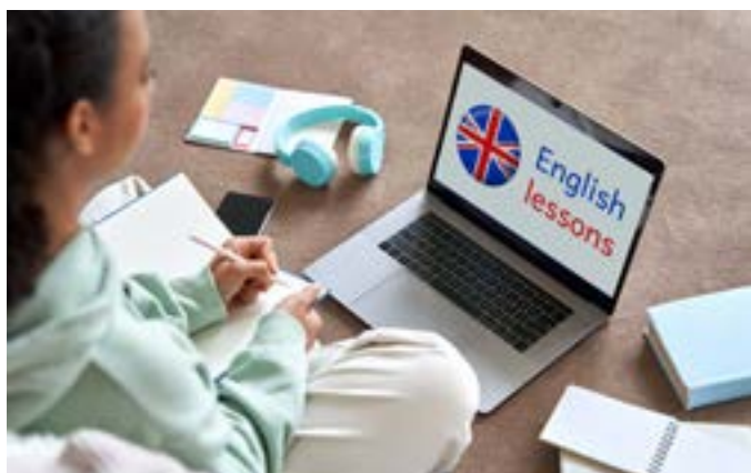
English lessons with an online teacher

The SVI co-ordinators never stop pampering you with new activities to help you spend a pleasant and useful winter. Why not improve your English or French skills before the big departure or just for fun?